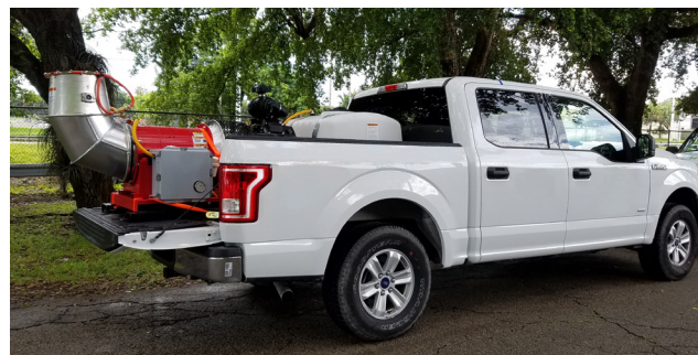
Mosquito control truck used for spraying larvicides like Bti.